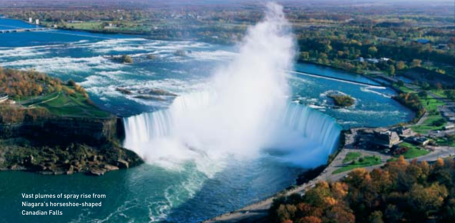
Vast plumes of spray rise from Niagara's horseshoe-shaped Canadian Falls