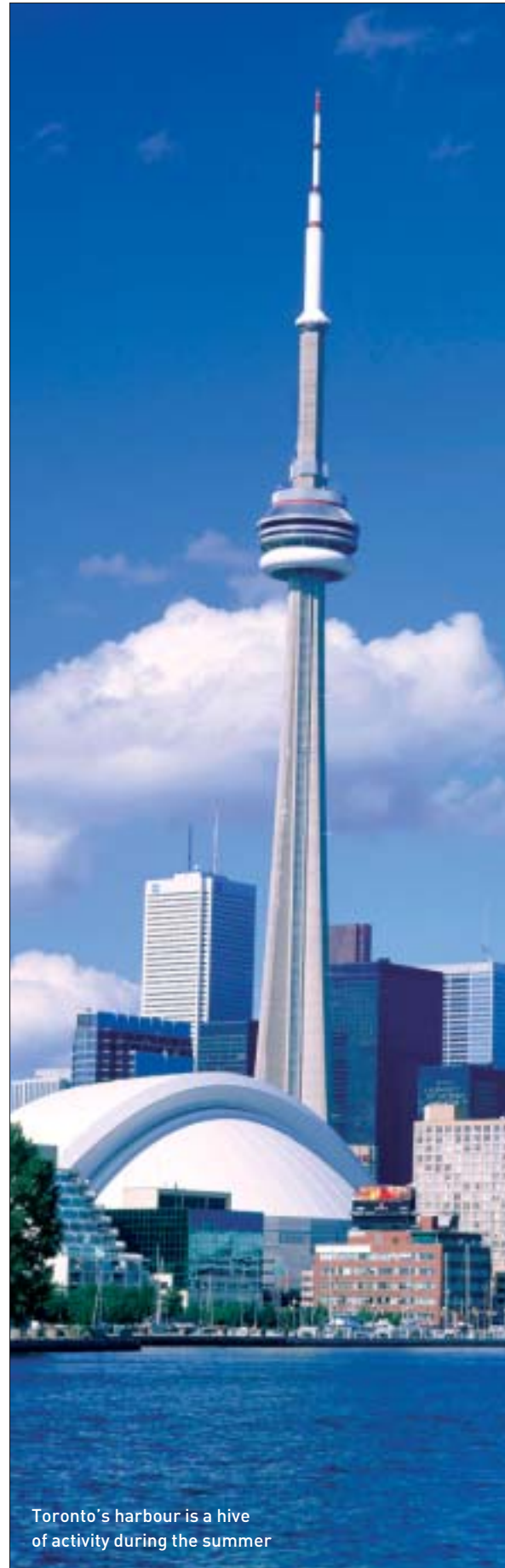
Toronto's harbour is a hive of activity during the summer